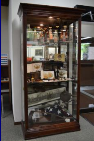
One of our display cases at the Chilton Public Library

Four displays of museum artifacts are located throughout Chilton in an effort to bring history into the community for year-round education and enjoyment. A long-term on-loan display of historic hub caps and license plates decorate a wall in the Chilton Department of Transportation office on Chestnut Street. A store front next to Hilde's Deli & Bakery on West Main Street in Chilton features an eclectic array of home and agricultural pieces which are rotated on a regular basis. The Chilton Public Library