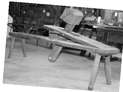
Check out page 4!