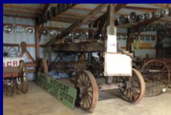
Just an example of what our museum has to offer